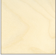
Birch - BIR